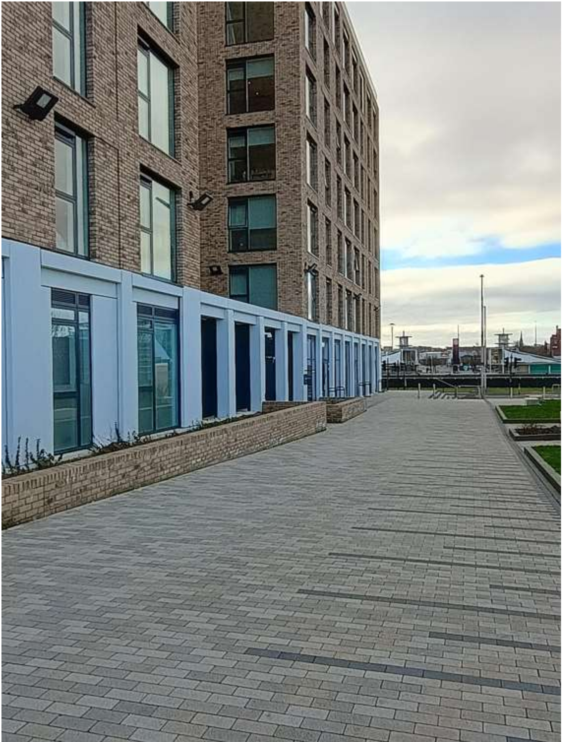
Pedestrian walkway – looking south towards the River Clyde