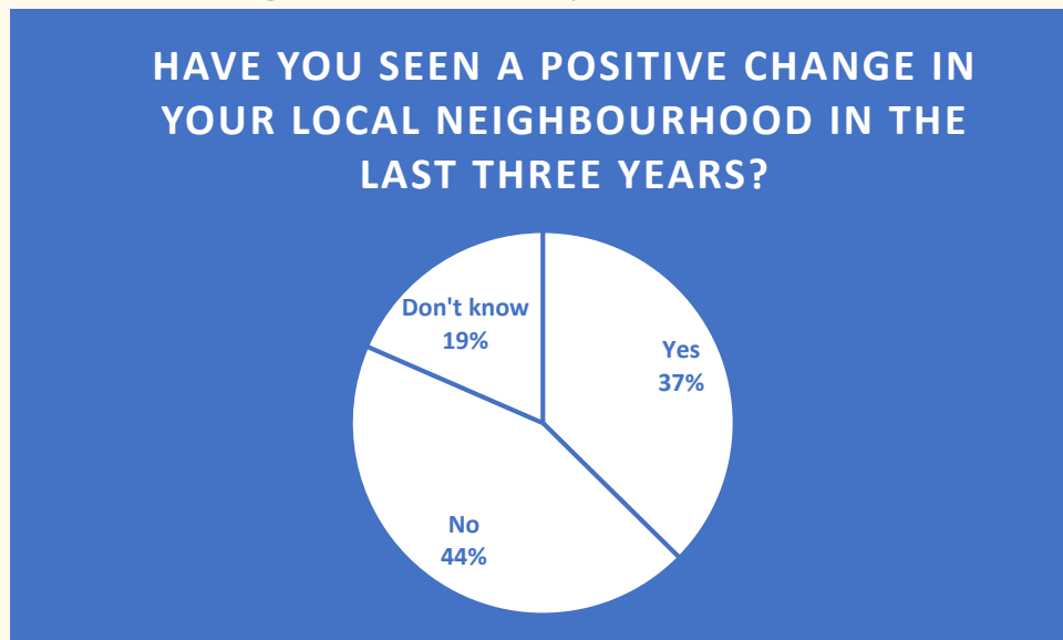
Figure 2 Responses breakdown to question 'Have you seen a positive change in your local neighbourhood in the last three years?'