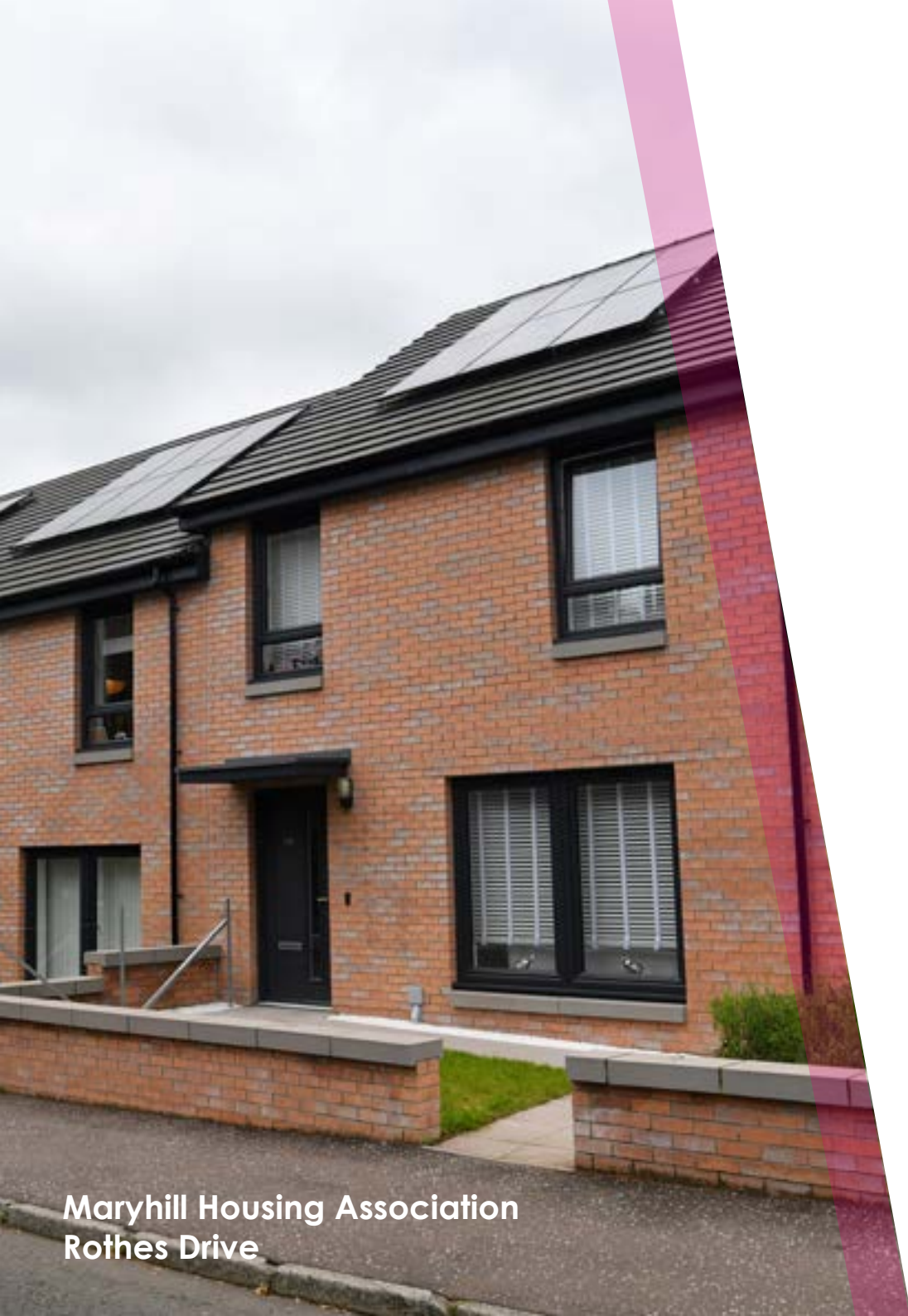
Maryhill Housing Association Rothes Drive

The key findings/issues from the 2022/23 PCRs are as detailed below: