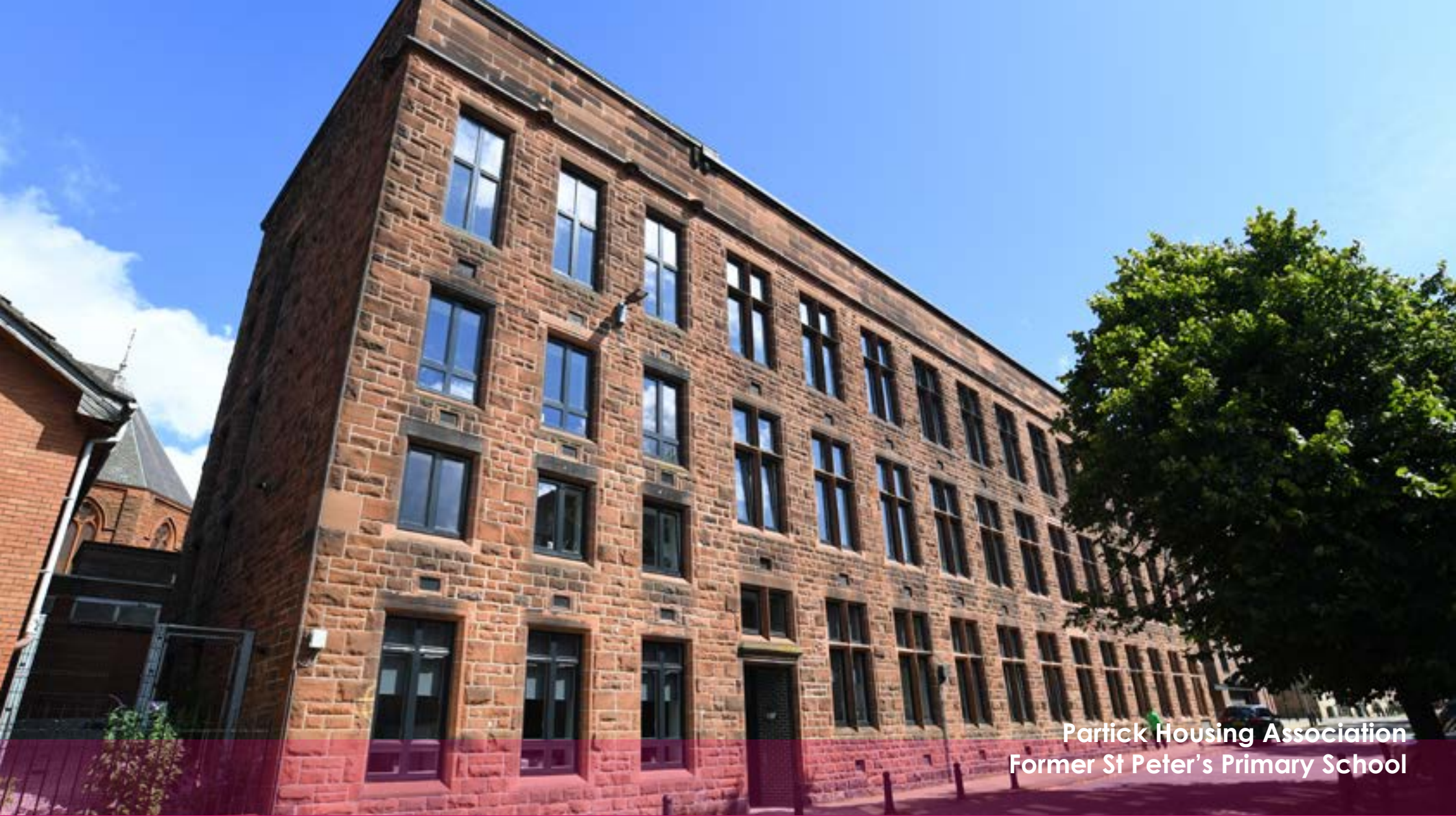
Partick Housing Association Former St Peter's Primary School