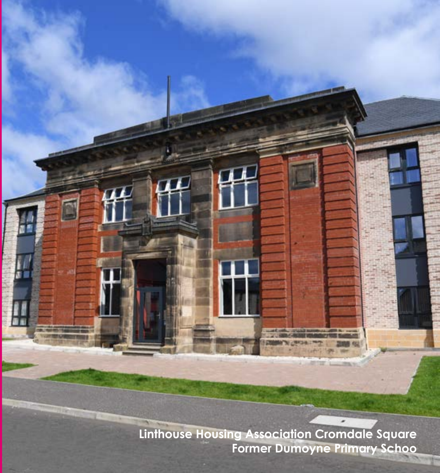
Linthouse Housing Association Cromdale Square Former Dumoyne Primary School

GLASGOW'S AFFORDABLE HOUSING SUPPLY PROGRAMME