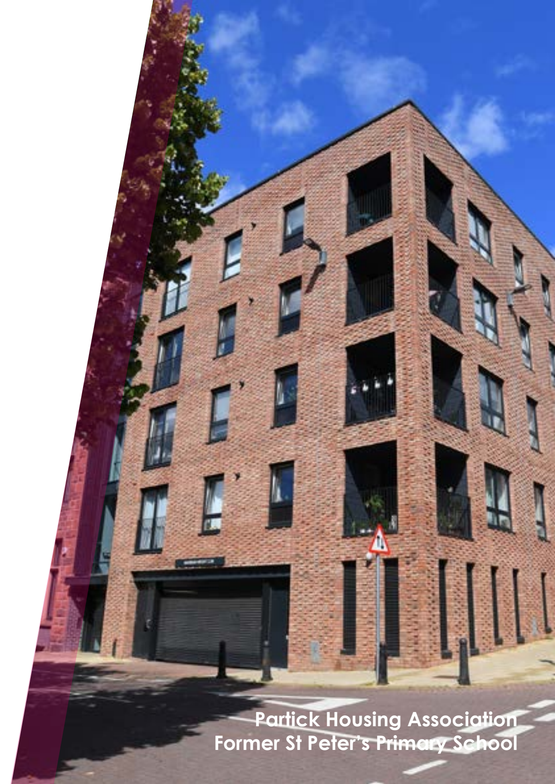
Partick Housing Association Former St Peter's Primary School

31 hectares were removed from the register as a result of residential development, of which around 17 hectares were as a direct result of the Affordable Housing Supply Programme, where over 350 units have been developed for new build housing across 13 sites of previously Vacant & Derelict land in the city.