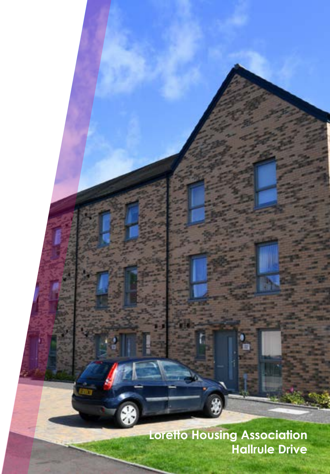
Loretto Housing Association Hallrule Drive

The above table shows the distribution of New Build Contracting work in 2022/23 tender approvals (by value of work approved).