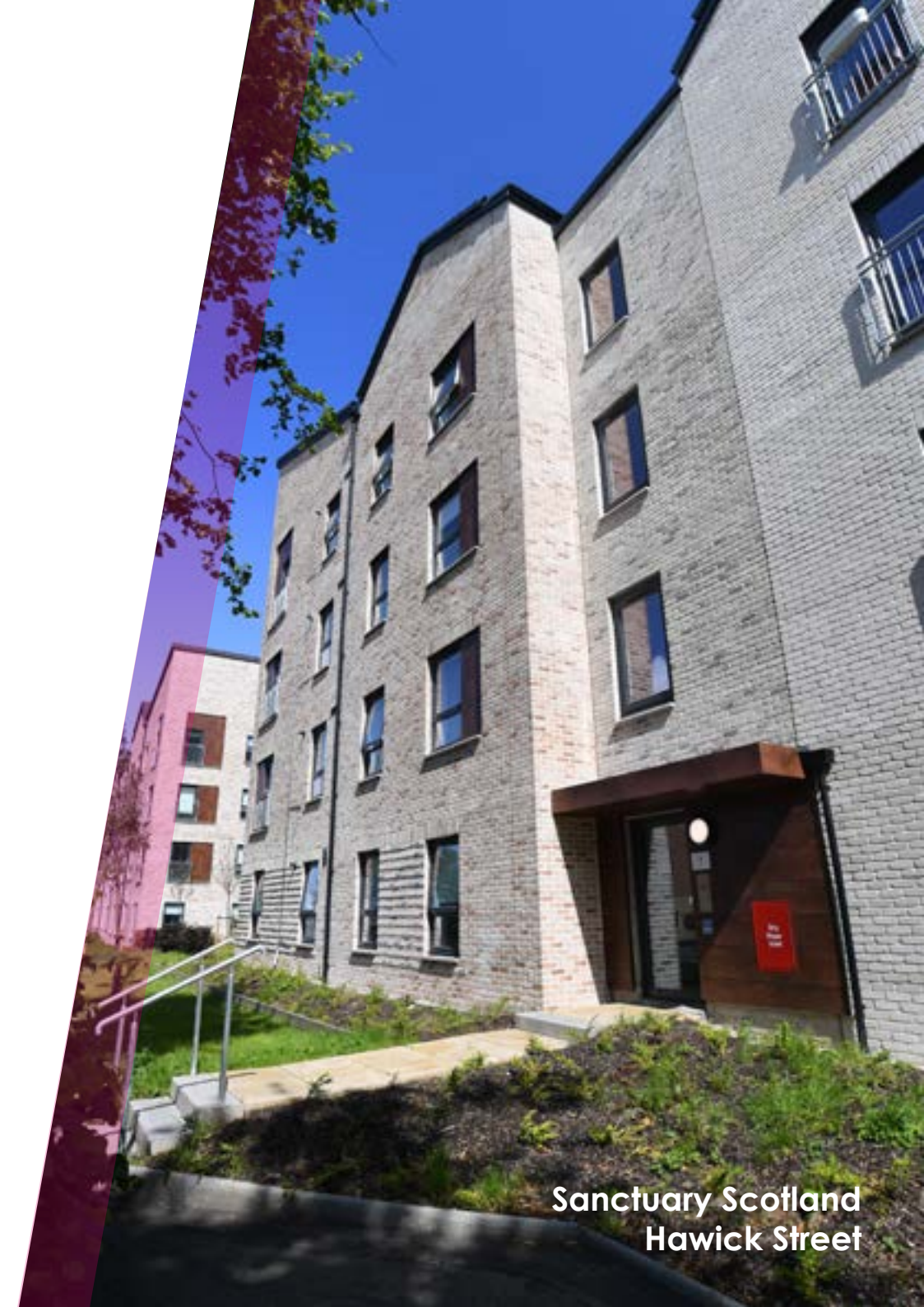
Sanctuary Scotland Hawick Street

In addition to this, donations totalling £16,897 were made by the developer, C.C.G., to Yoker Bowling Club, the Church of Scotland and the Glasgow Northwest Foodbank.