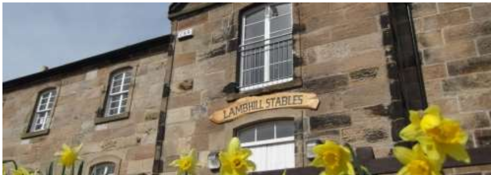
Lambhill stables, 2017.

Lambhill Stables was established in 2017 with the aim of providing recreational, occupational, training and employment opportunities for local people. The café provides affordable healthy food and uses ingredients from the stable's community garden whenever possible. There are various community-led activities such as a toddlers clubs, language lessons, a photography club, a walking group and family storytelling.