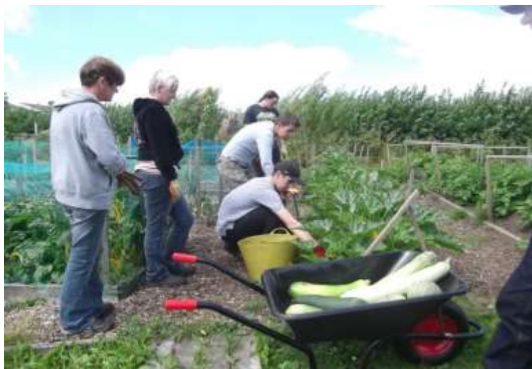
Lambhill Stables Community Garden, 2017.

There are a range of learning and development, leisure and recreation, employability and health and well-being activities for the local and surrounding communities. This includes programmed activities, classes, services, clubs, events, community led activities, drop-ins and community meetings. Some of these activities are carried out in partnership with other services and organisations such as Glasgow Life, North Healthy Living Communities, Kelvin College, Love Milton, Partick Thistle Football Club and the Active Schools programmes.