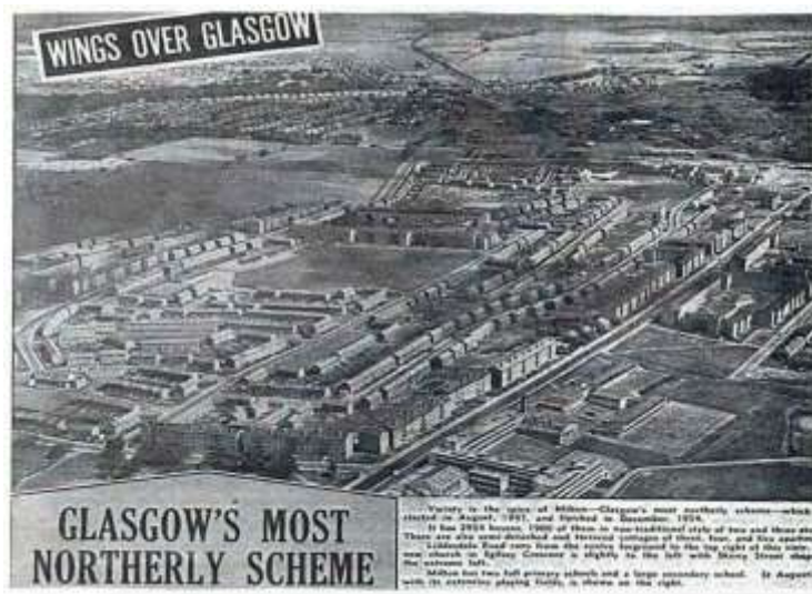
Milton from the sky, 1950s.

opportunities for entertainment became apparent. Social problems started to emerge with gang fighting and drug abuse causing major urban decay.