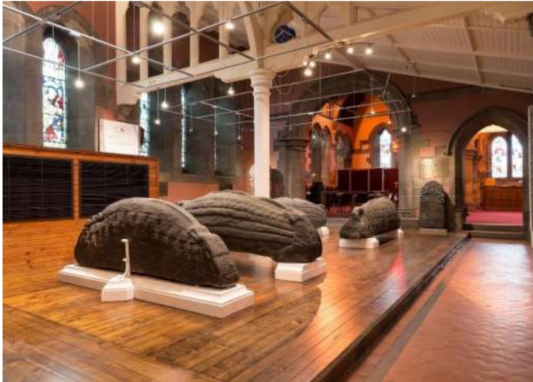
Medieval Stones, Govan Old Parish Church/Museum, 2017.

There are several historic buildings. Govan Old Parish Church/Museum holds 31 early medieval stones carved around the 9 th to 11 th centuries. The Fairfield Heritage Centre hosts an exhibit on Clydeside's shipbuilding history.