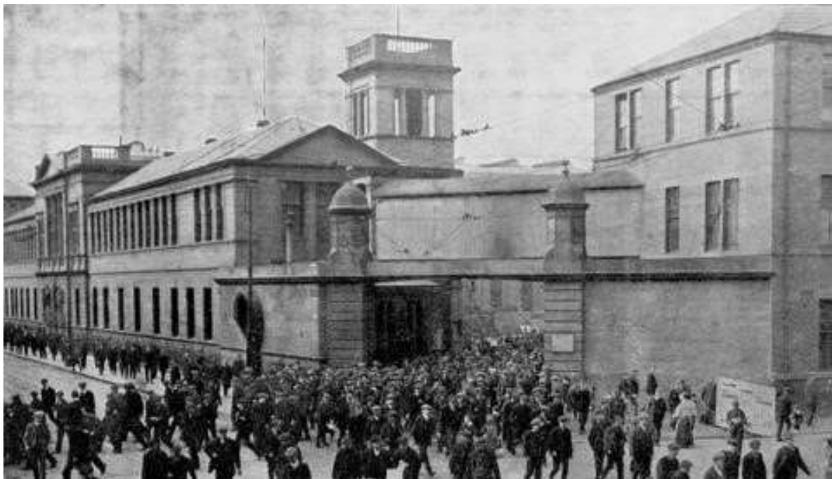
The Fairfield Shipyard in the early 20 th Century.

The majority of Govan's new residents were employees in the new industries. Shipbuilding became an integral part of the identity of Govan, with many families depending on the shipyards for their livelihoods. Today, this connection continues and many of Govan's inhabitants claim a connection, either past or present, to the shipyards of the burgh.