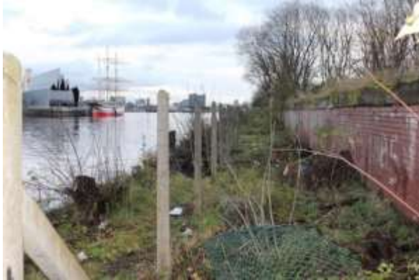
The Govan Walkway, 2016.

There are also plans to improve the public space at Govan Cross and £400,000 was secured in 2017 by Glasgow City Council and Elderpark Housing Association from Scottish Government's Regeneration Capital Fund to refurbish Elderpark Community Centre.