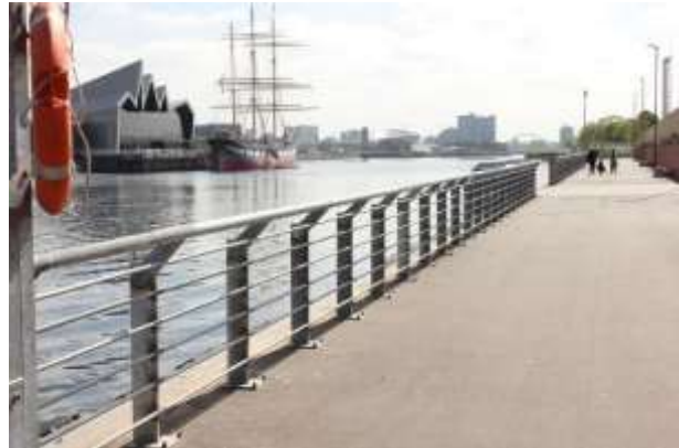
The Govan Walkway, 2017.

EPHA has also been given development funding from Big Lottery Community Assets to prepare designs and carry out community consultation and this process is underway. Architects are currently preparing design drawings based on the results of the recent user groups, potential user groups and general community and these will be submitted along with costs to Big Lottery for match funding for the new build.