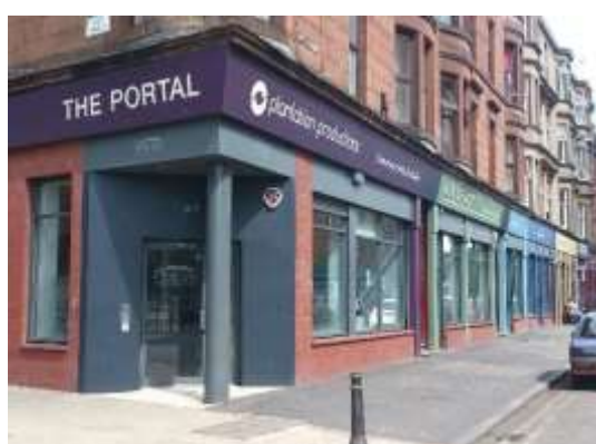
The Portal, 2017.

The Portal is a community arts hub based in Govan and managed by a local charity, Plantation Productions. In 2013, the Portal won Scottish Urban Regeneration Forum's 'Best Practice in Community Regeneration' Award. This was in recognition of the joint vision and strong partnership working across all aspects of the project, which had successfully transformed a derelict building into creative spaces that respond to the heritage of Govan.